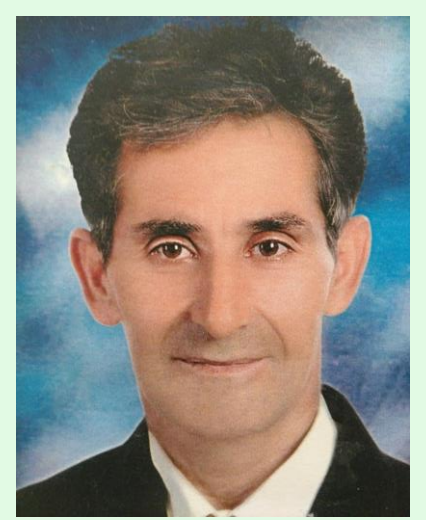
Writer: Riza Dolama

And we can rescue form lower worlds' Birth and Dye Circulates. (Riza Satisfied)